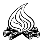
Family Camp Illiana at Washington Sept. 3—6 We have registration info!